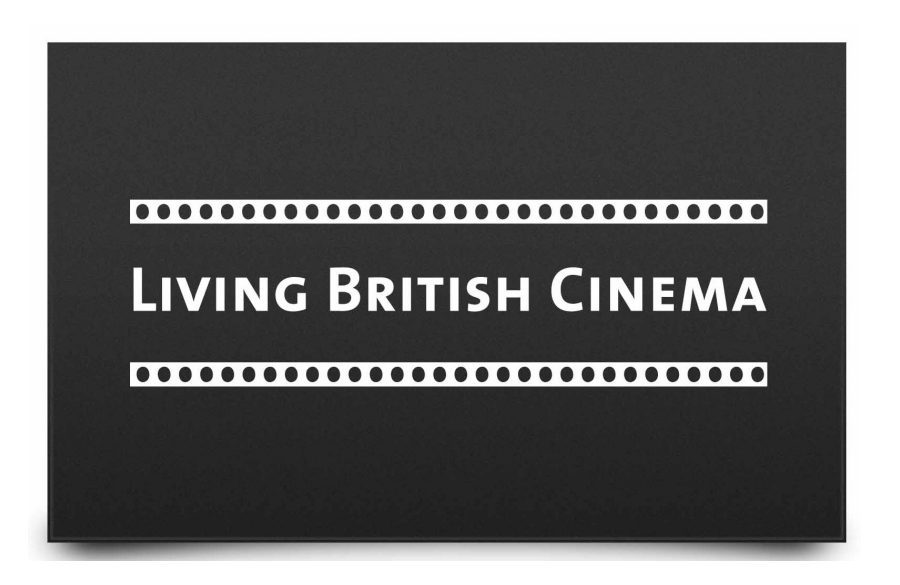
Festival 2012, June 12-14th

For more information email us at <a href="mailto:LivingBritishCinema@gmail.com">LivingBritishCinema@gmail.com</a>